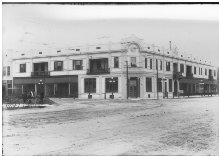
VIEW OF HISTORIC CAMFIELD BUILDING

There are a variety of community sponsored annual events for residents to attend and participate in including: the Arts Picnic, First Friday Art Shows around old downtown, Greeley Jazz Festival, Oktoberfest, and the nationally acclaimed Greeley Independence Stampede.